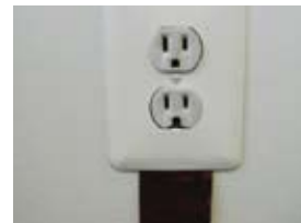
Step 7. Finish installation by re-attaching AC outlet cover with screw removed in Step 1.