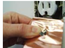
Step 3. Punch small hole in 24" copper grounding strip provided with ESD flooring. The hole should be smaller than the head of the screw removed in Step 2.