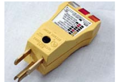
Any electrical outlet can be tested using a ground plug adaptor.

NOTE: If any other condition exists, do not use the receptacle or the Ground Plug Adapter until tested and approved by a qualified electrician. Examples of wiring defects are not limited to the conditions described below.