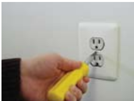
Step 1. Remove center screw on cover of AC electrical outlet using a screw driver.

Prior to the installation of the static control flooring the electrical contractor can tie in a ground wire (#10 or #12) to a convenient ground bus or an electrical outlet. Then the wire is fed down the inside of the wall to the floor line, where the baseboard meets the floor. Bring the wire through a small hole in the drywall at the floor line. From here it can be easily attached to the floor ground. The exposed end of the copper-grounding strip is then wound together with the ground wire and tightened together with the use of a wire nut to securely hold it in place. This connection of the two leads is then pushed into the hole in the wall along with the excess wire. The baseboard or wall base can be used to cover the strip when once they are applied to the wall.