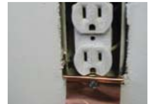
Step 4. Secure copper strip to the AC electrical outlet with the same screw removed in step 2.